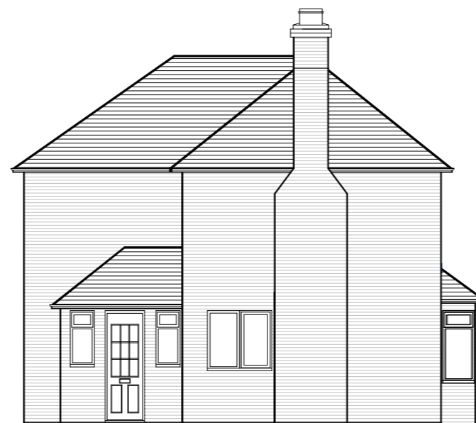
Proposed LH Side Elevation